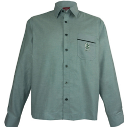
Long Sleeve Shirt $39.40