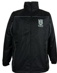
Rain Jacket $79.80