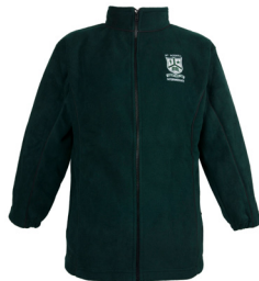
Fleece Jacket $66.00