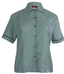
Short Sleeve Blouse $35.60