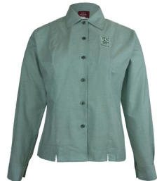
Long Sleeve Blouse $39.40