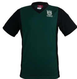
PE Top $35.60