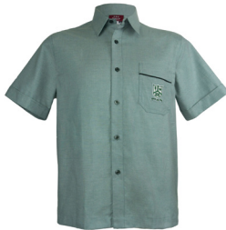
Short Sleeve Shirt $35.60