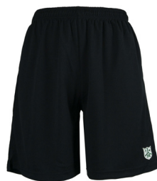
PE Shorts $25.70

The Mt Roskill Intermediate School uniform is available to purchase from Argyle Schoolwear online, go to www.argyleonline.co.nz and select Mt Roskill Intermediate School under Shop ArgyleOnline.